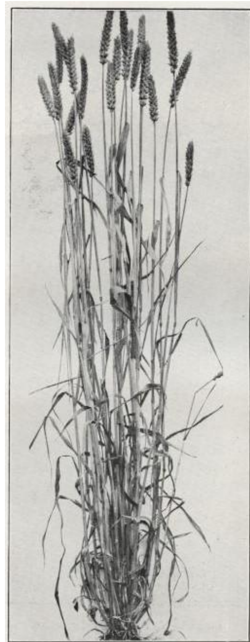
FIG. 29.—A well-grown plant of Yeoman II.