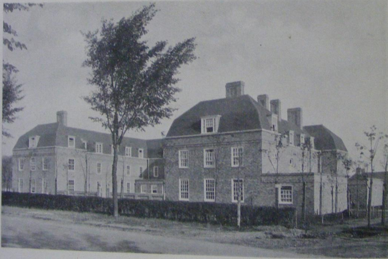
South Side : from the Huntingdon Road.