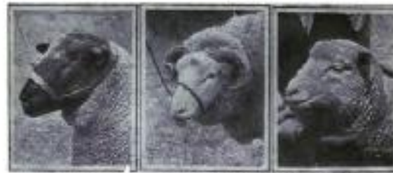
AN ILLUSTRATION OF INHERITED CHARACTERISTICS IN SHEEP.

The black-faced Norfolk ram (at left) when crossed with the white-faced ewe of the horned Dorset breed (in middle) results in animals with speckled faces, of which the males are horned and the ewes hornless. Breeding from the latter leads to a type of ram (at right) combining the white face of the Dorset with the horns of the Norfolk.